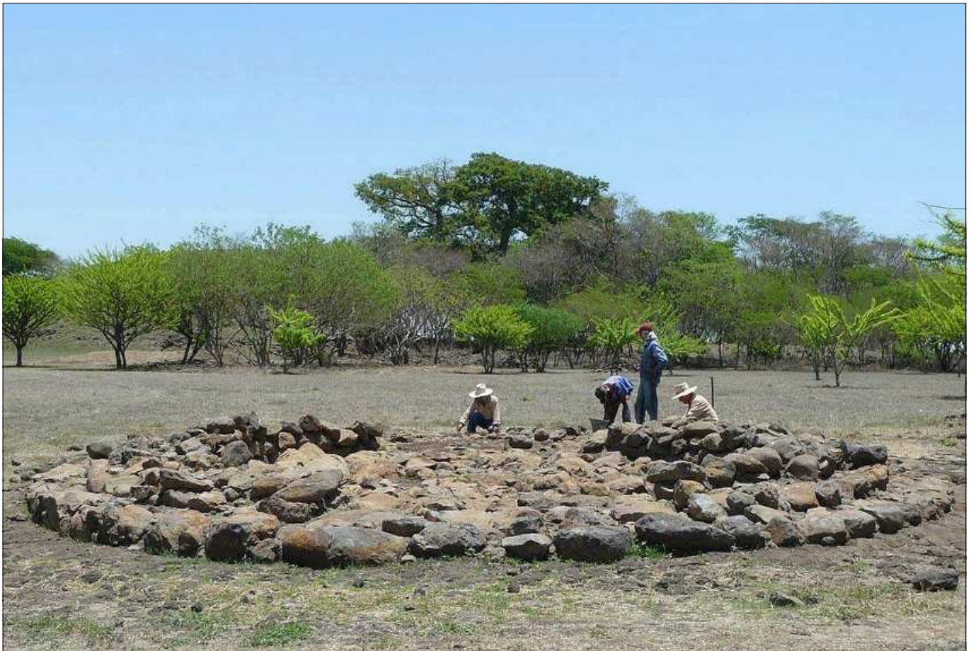
Fig. 11. P-28 has now been conserved, a necessary step in a public park with many visitors, and is integrated into the Interpretative Trail. In this view looking east workmen do the final touches of consolidation.

We also cannot be sure of the intended final form of P-28, given its unfinished state at the time of the burning of Cihuatán. As it stands, it appears to have had a large fan shaped entrance, perhaps the base for projecting stairs in the manner of Late Postclassic structures, facing towards the east, but not quite aligned with the main stair of the main pyramid P-7. Pollock (1936:160) remarks that temples to the wind god generally had their entrance facing east as this was the direction associated with Ehécatl-Quetzalcóatl. However, P-28 apparently also had a rear entrance, a feature not seen on any of the round buildings illustrated by Pollock or, indeed, seen in the excavated round structures known from Postclassic Mexico. Some sort of entrance on the west was clearly intended, as the semi-circular platform walls have an opening the same width as the narrow upper end of the fan-shaped entrance on the east. The western entrance, however, seems to have been a stair set into the platform. Does this indicate that P-28 was not to be a building, but rather a solid platform? If so, this opens up another very possible function, that of a gladiatorial platform.