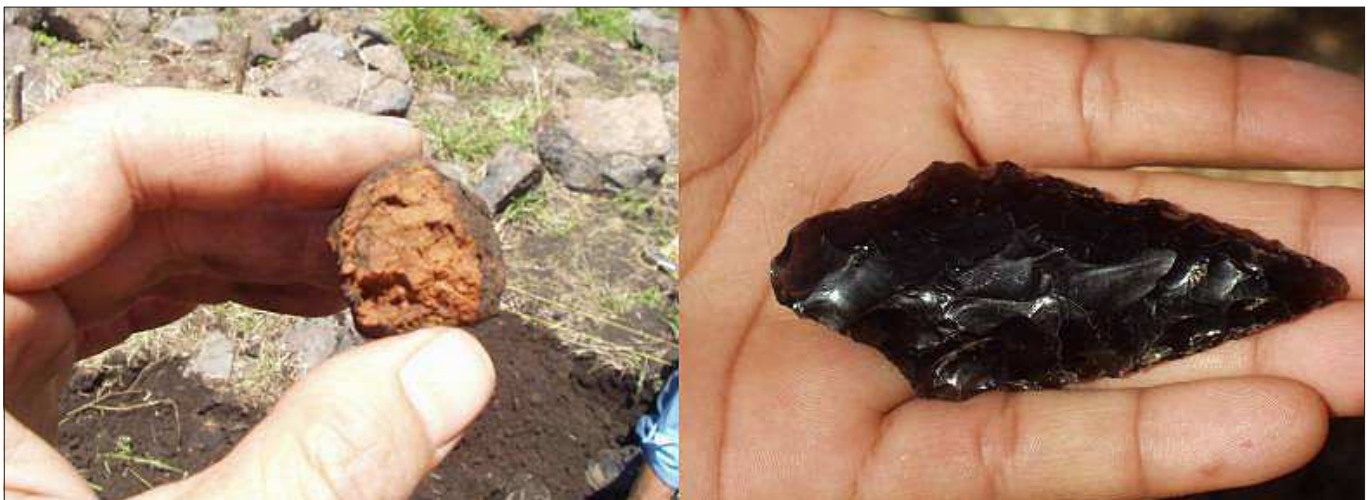
Fig. 10. One of the numerous pieces, large and small, of burned earth on P-28 and a spear point found within the upper levels of the fill.

is not enough excavation-based information to delineate the specifics of the transition from frontier Maya to frontier Mexicanized Maya (or Mayanized Mexicans) in the Early Postclassic. One might add that the transition from the Early Postclassic Cihuatán Phase to the Late Postclassic Nahua-speaking Pipil is even less explored. All we can be sure of is that there was no smooth transition from one cultural/linguistic affiliation to the other. No Cihuatán Phase site known has a Late Postclassic occupation; in every case the Cihuatán Phase is the terminal occupation, even in sites such as San Andrés, where the Cihuatán Phase exists on top of the Classic Maya occupation. All known Cihuatán Phase sites were terminated by fire and permanently abandoned. The area of Cihuatán was still largely abandoned at the time of the Spanish invasions, suggesting that the effects of the events which terminated the city were still being felt.