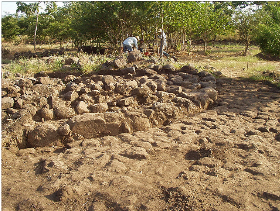
Fig. 2. P-28 during excavation. The round shape is clear, but the platform had been used (by park workmen) to throw loose rocks upon, resulting in a loose pile of unassociated stone covering part of the platform.

covered with an enormous elite residential/religious/governmental complex. The Acropolis is currently under excavation and will be the subject of a later publication.