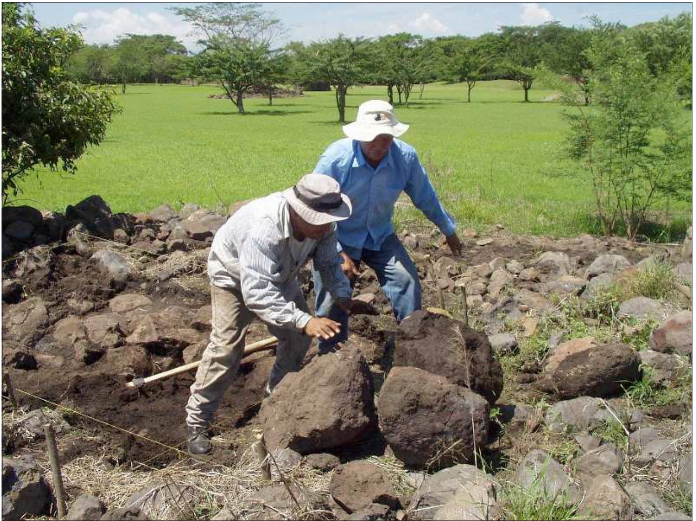
Fig. 6. Workmen moving some of the enormous rocks that constituted part of the fill of P-28.

the main pyramid, is a large fan-shaped structure of cobbles reaching, in its current state, to the second stage of the platform (fig. 9). The fan, which may have been intended to form the base for a projecting stair with balustrades (seen in some other structures at Cihuatán), is approximately 3.78 m in length and 7.66 m wide on its eastern end. Where it abuts the structure and is narrowest it is 5.68 m wide. We postulate that this fan was the foundation for a large stair to the entrance in the wall at the top of the platform or simply to the top of the platform.