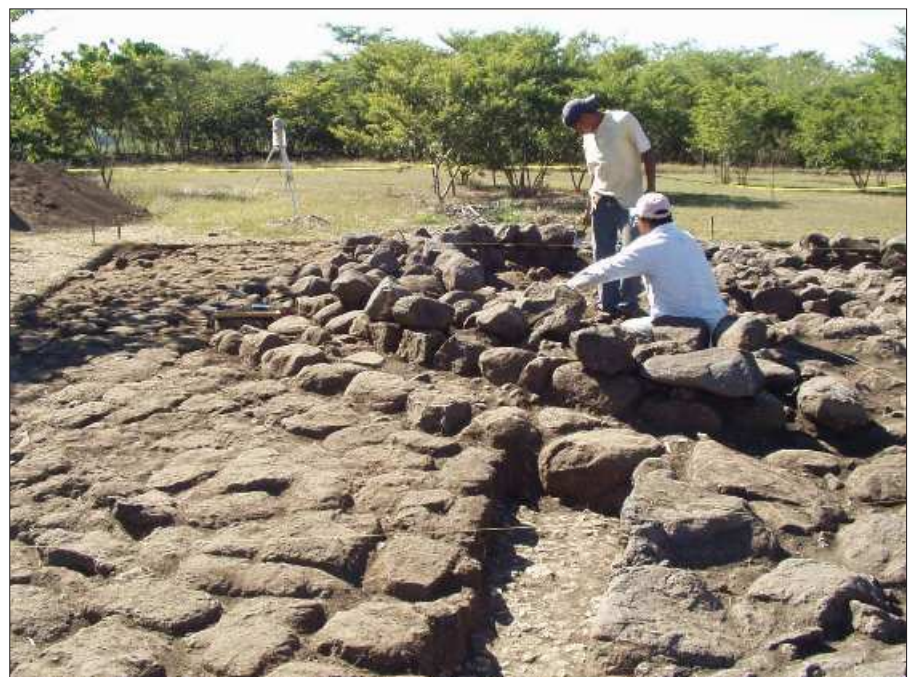
Fig. 5. View of P-28 from north, showing the large, slightly worked, stones forming the containment wall.

The structure was meant to have two entrances, one on the east (orientation 74° mag.) and one on the west. The eastern entrance, which is roughly oriented towards