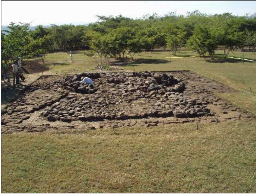
Fig. 4. P-28 looking west. The large, fan shaped entrance and well preserved containment walls are clearly visible, as is the white pumice cobble underlayment of the structure.

fragments of Tohil Plumbate pottery, the leg of a ceramic feline statuette, a few broken bits of obsidian blade, and a number of fragments of the solid clay objects generally called almenas , 2 although their actual function is not known (figs. 7-8).