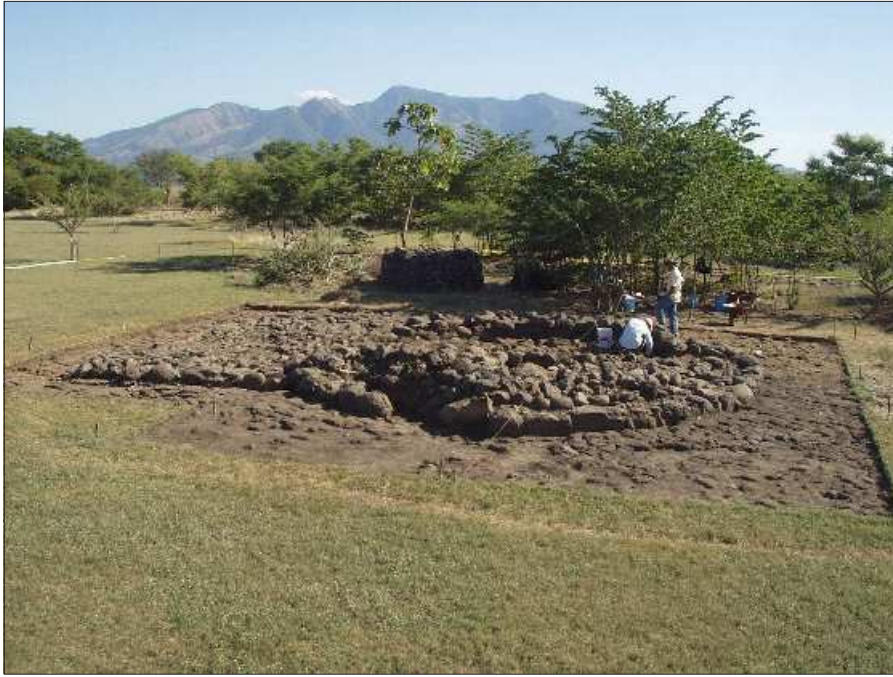
Fig. 9. A semi-vertical view at the end of the excavation shows the cleared structure with its large frontal fan. The area of damage on the north side, visible as a sort of trench, is from an iguana hunter. Iguana and armadillo hunters are among the greatest threats to El Salvador's ancient buildings.

n.d.a and b, 1980a and b, 2006; Haberland 1960, 1964, 1989; Stocker 1974, Fowler 1991 inter alia ). The monumental architectural style of this phase is also closely related to that of the central Mexican Postclassic. On the other hand, much material culture remained the same, including the lack of tortillas in the diet and, in general, the domestic ceramic complex and the styles of houses lived in by the general populace. Nor is there any evidence for general depopulation in western El Salvador at the end of the Epiclassic. On the contrary, one can make a good case for a sudden population increase, perhaps immigrants fleeing the collapsing polities of adjacent Maya regions. It is possible that some of these, especially if they came from the relatively more Mexicanized Maya cultures of, say, highland Guatemala, may have brought the Mexican elements and introduced them to El Salvador.