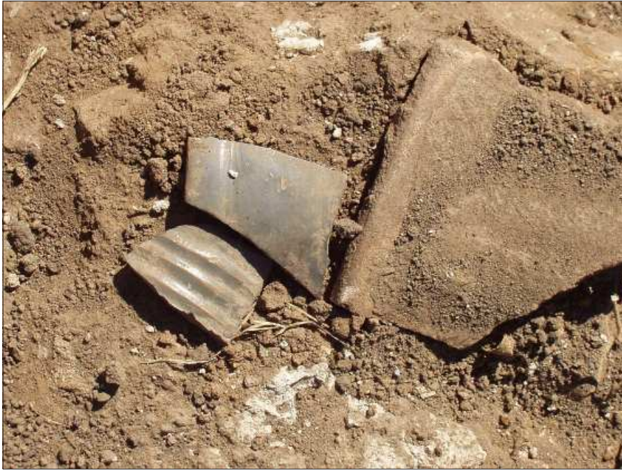
Fig. 7. Tohil Plumbate and local ceramic sherds in situ .

temple and many other Late Classic or Epiclassic round structures in Yucatan, Belize, and Guatemala have, perhaps, been too hastily identified as Wind God temples. 3