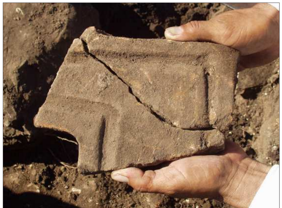
Fig. 8. A fragmentary almena recovered from amidst the rock fill of P-28.

Since round structures in El Salvador are so poorly known we have no comparative material to help in the identification of this enigmatic structure. Certainly in Late Postclassic central and Gulf Coast Mexico, if not elsewhere, round temples were commonly associated with Ehécatl-Quetzalcóatl. It is also the case that Gulf Coast influence is manifest both at Cihuatán and at earlier sites in El Salvador (cf. Andrews 1971; Boggs 1950, 1972; Casasola 1976-77, Bruhns 1980 inter alia ). However, not all round temples were wind god temples, to judge from the number of round or partly round structures—and their diversity—found in Mexico and the Maya area from the Preclassic onwards. Pollock notes that in the Late Postclassic the chroniclers Motolinia and Torquemada both mention that not all round structures were dedicated to Ehécatl-Quetzalcóatl, but that “other gods” were also worshipped in them (Pollock 1936:32). It is possible that there may not have been such a strong identification of round structures with a specific (Mexican) deity in the Maya area. The well known Caracol, or Observatory, at Chichén Itzá is, of course, a good example of a round structure which probably was not a Wind God